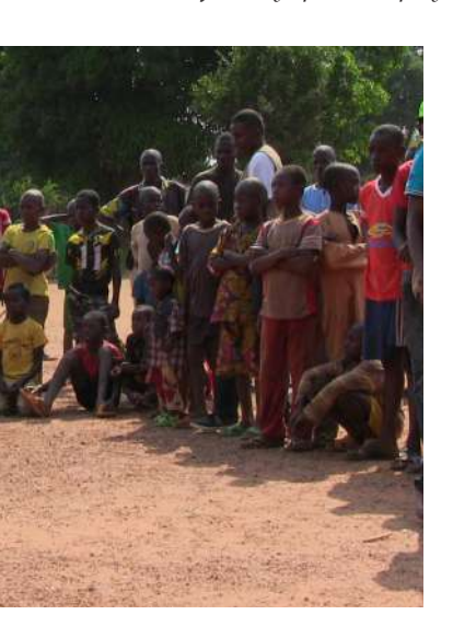
A child in the courtyard of the Mosque in PK5 where communities have fled to