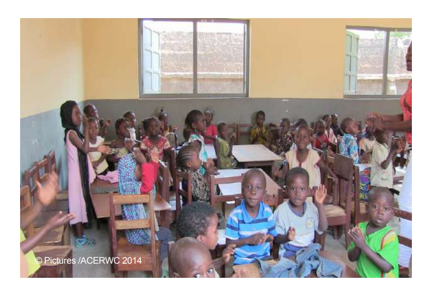
A\ Child\mbox{-}friendly\ space\ in\ PK\ 5

materials are stolen. The schools have not been rebuilt and are being occupied by armed groups particularly in rural areas. Some schools remain closed since the outbreak of the conflict. For over one million children, primary universal education is not currently secured. In some regions, children prefer to engage in gold washing activities rather than going to school due to lack of teachers and fear of the conflict and take refuge in more secure areas. The start of the school year scheduled on November 20, 2014 was not effective.