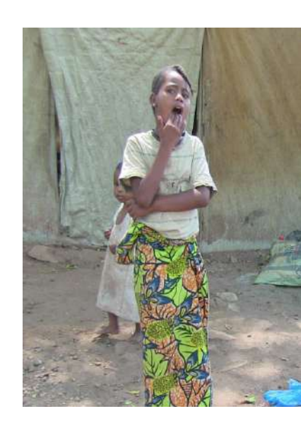
Families living in the courtyard of the Mosque in PK5

Signboard of a re-insertion Program targeting former children associated with armed groups in Bria