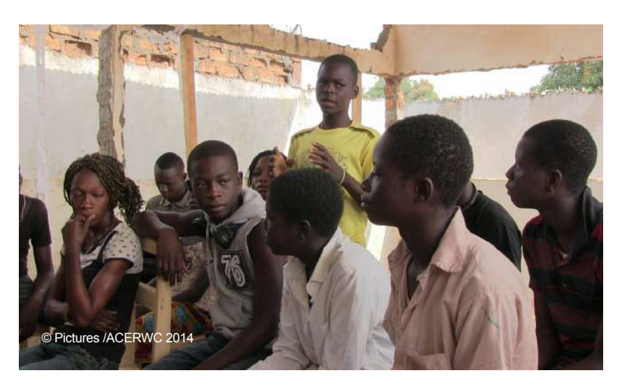
Children are kept busing with their peer to prevent idleness and drives to join armed groups

11. Despite the various calls of the government to the education staff to return to their position, several teachers did not return to still accessible schools for security reasons. Children who shall cross neighborhoods controlled by rival armed groups to reach school, do not go to school because they fear for their safety. SMS campaigns on mobile networks were also launched urging students to resume classes to save the school year. Development partners have also set up child-friendly spaces where children are gathered according to their age to attend classes delivered by NGO volunteers. Despite all these efforts, it is still very difficult to take all children to school, because the courses are provided in sheds and classrooms are open to the wind.